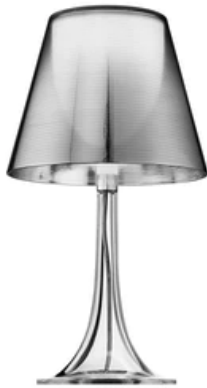
Table lamp providing diffused light. Fully transparent, injection-molded PMMA polymethylmethacrylate frame; opaline, injection-molded polycarbonate internal diffuser and injectionmolded transparent or colored polycarbonate external diffuser completely finished with high-vacuum aluminization process.